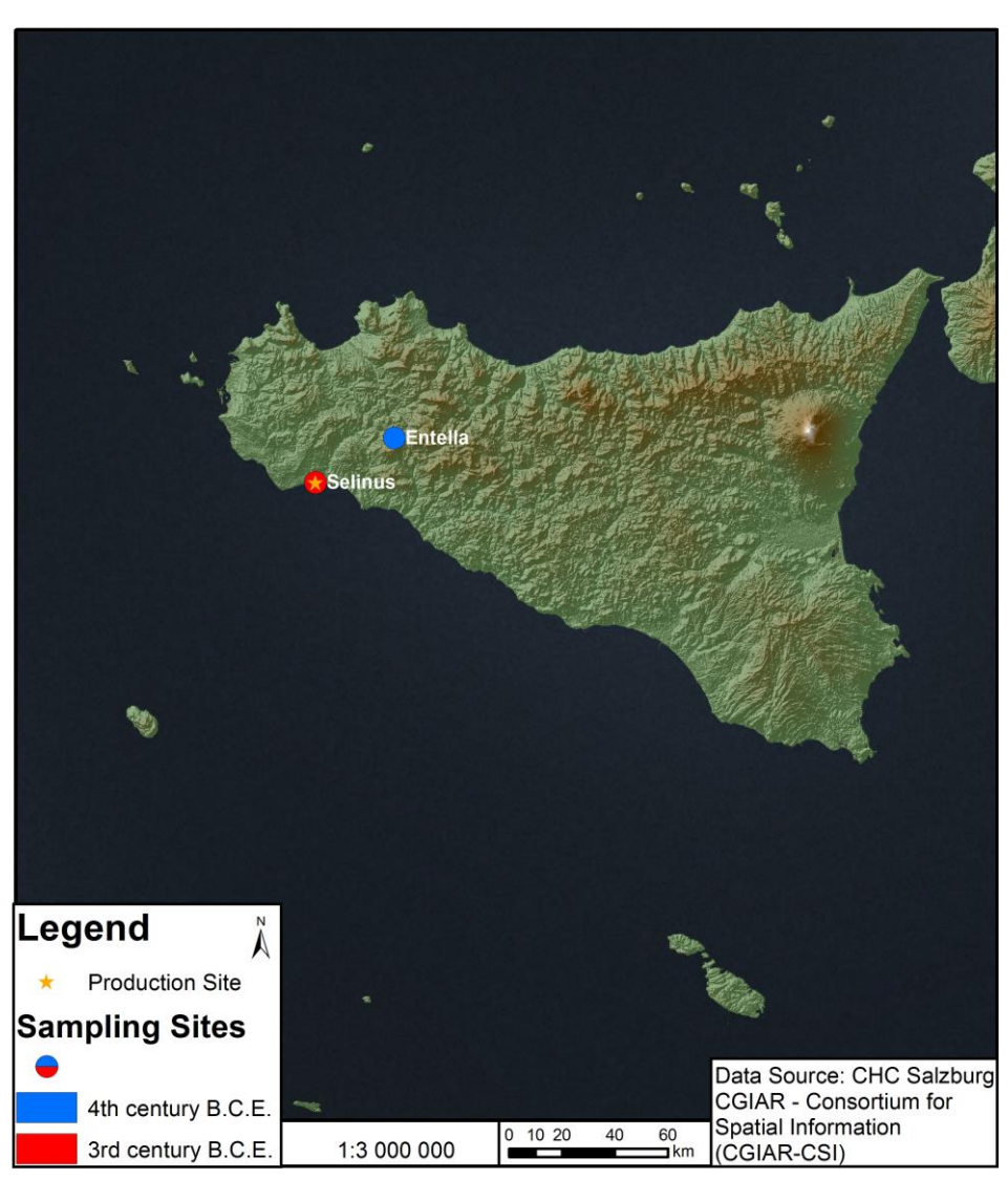
Fig. 1. The sampling sites yielding amphorae from Selinus. Fragment chronology as on new petrographic and follows: Blue 4th century B.C.E. Red 3rd century B.C.E.

Currently, research on pottery production in Punic Selinus is at a very initial stage. Despite the discovery, during the 70s and 80s, of several ceramic kilns in 'isolato FF 1' and in the south-eastern part of the acropolis (see ch. 2), no systematic study of these archaeological remains and their contexts has yet been presented. Very recently, previous archaeometric investigations have been supplemented with indepth research into the possible raw materials used by ancient potters, based